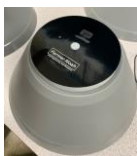
The Farmer Noah System