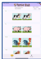
“Animals “in qty, 2, 4, 6 or 8